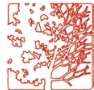
Watch for the official sign with Muskoka Autumn Studio Tour logo